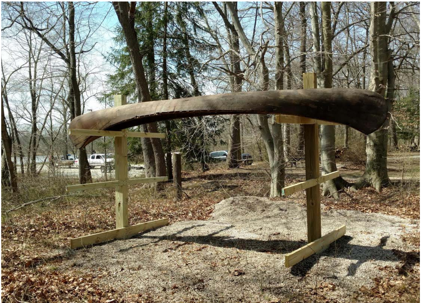
A six capacity canoe /kayak rack was recently installed near the canal boat ramp. No fee. Use is at boat owner's risk.

Swimming or not come on out for lunch or a sweet treat!